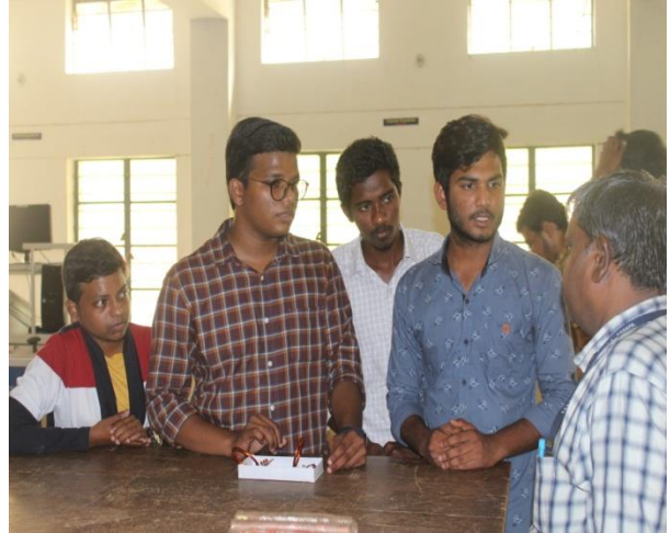
Working model of Winners