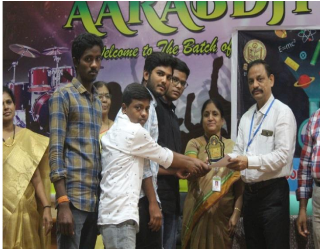
Model presentation Winners receiving Cash prize of Rs.1000/-