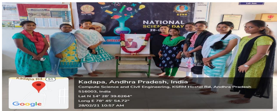
Garlanding potrait of Sir.C.V.Raman