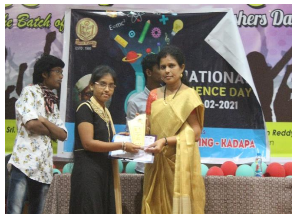
Presenting memento to Runner by Coordinator