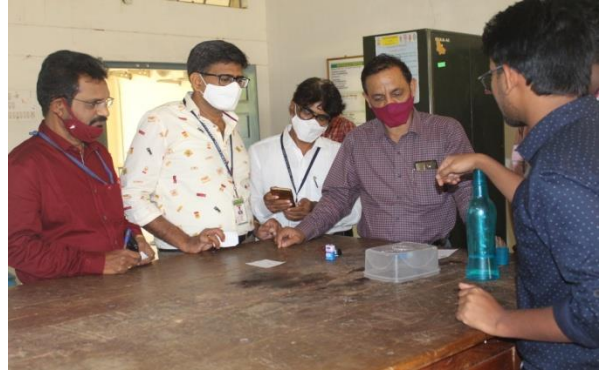
Director & Other HOD'S Visited Model presentation