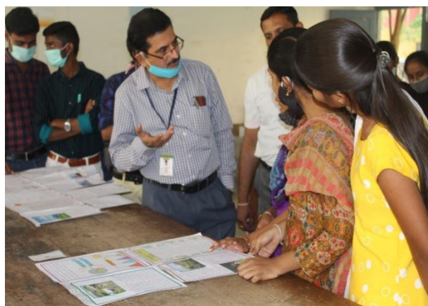
Reports presented by Students and gallery visit by Principal