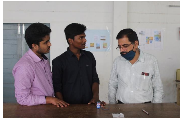
Model presentation visited by Principal & HOD