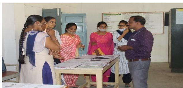
Visiting Report writing by principal & Faculty