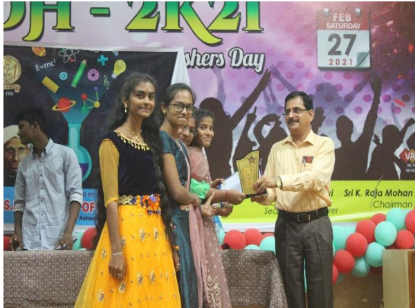
Presenting memento and certificate to Winners by Principal