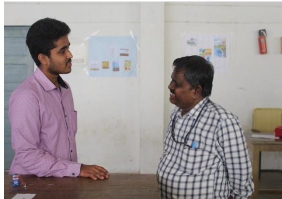
Observation of models by Faculty