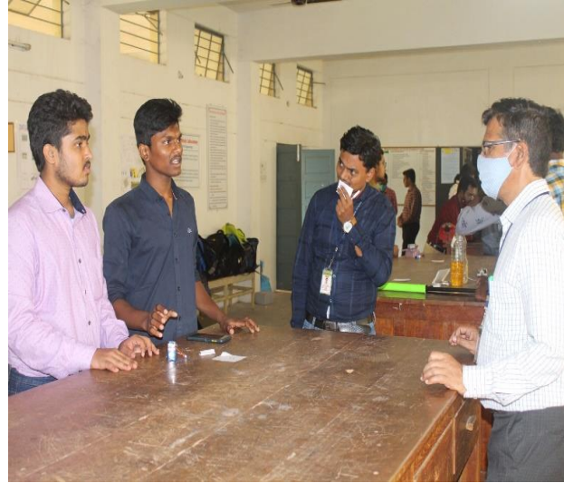
Model presentation visited by Director