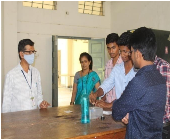
Working model by Runners