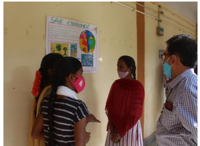
Gallery visit by Principal