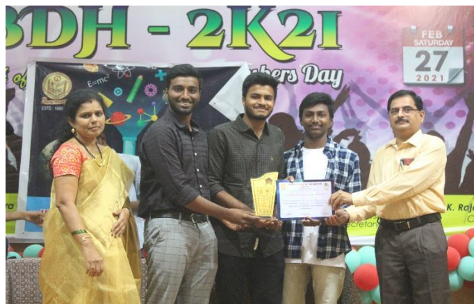
Presenting memento and certificate to Winners by Principal