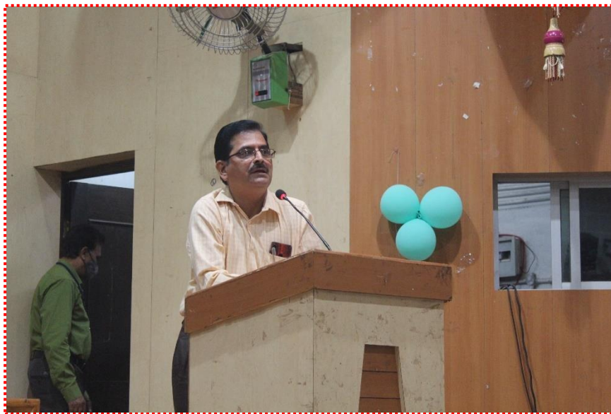
Speech by Principal