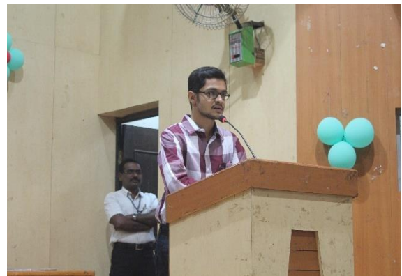
Students sharing their ideas