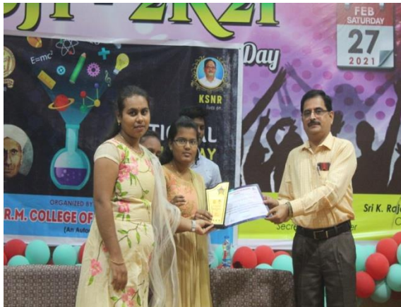
Presenting memento and certificate to Winners by Principal