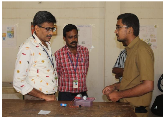
Faculty visiting Model presentation