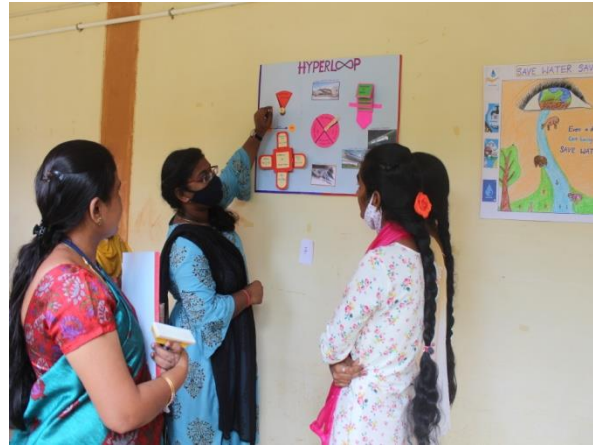
Poster presented by 1 st prize winners