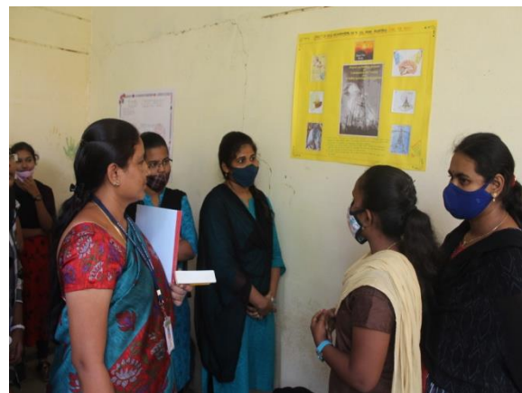
Poster presented by 2 nd prize winners