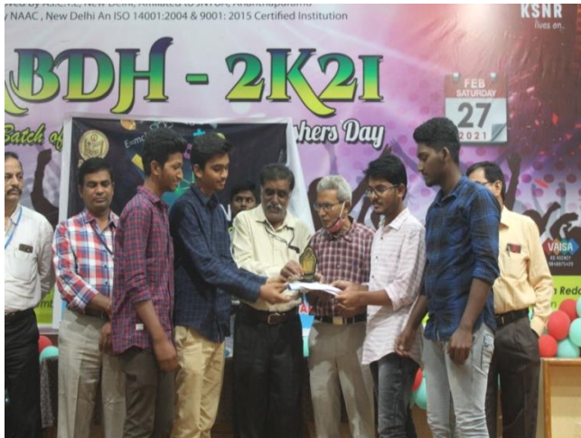
Model presentation Runners receiving Cash prize of Rs.500/-