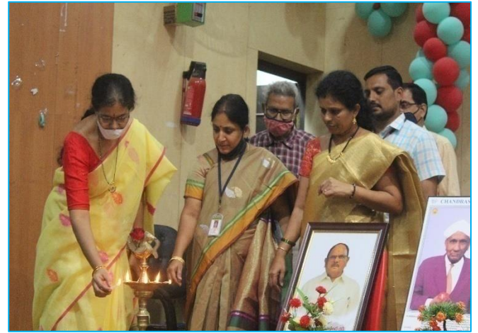
Lighting lamp by Principal, HOD & other dignitaries