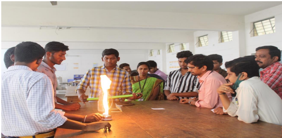
Explaining working model of project by participants